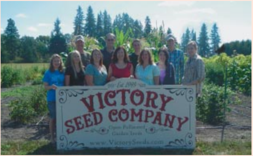
The Summer 2014 Victory Seed Company Crew