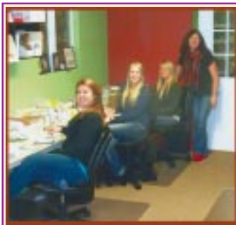
The ladies who fill your orders