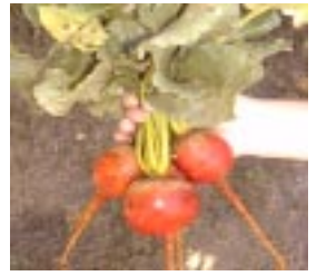
'Golden Detroit' Beet