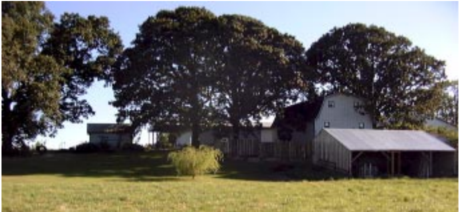
A summer scene on the farm.

All of our seeds are open-pollinated and untreated. Most are family heirlooms or rare commercial heirlooms. No chemicals, unstable hybrids or GMOs!