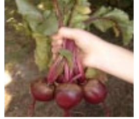
'Green Top' Beet

All of our seeds are open-pollinated and untreated. Most are family heirlooms or rare commercial heirlooms. No chemicals, unstable hybrids or GMOs!