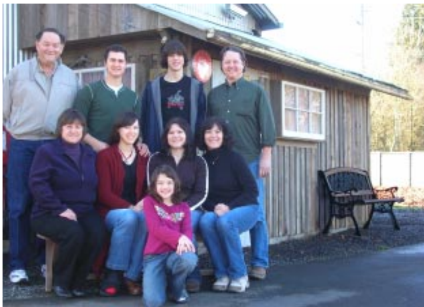
“The Crew” - December 2006