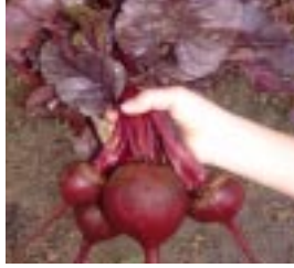
'Bull's Blood' Beet