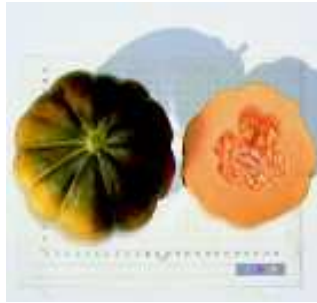
'Nois des Carnes' Canteloupe