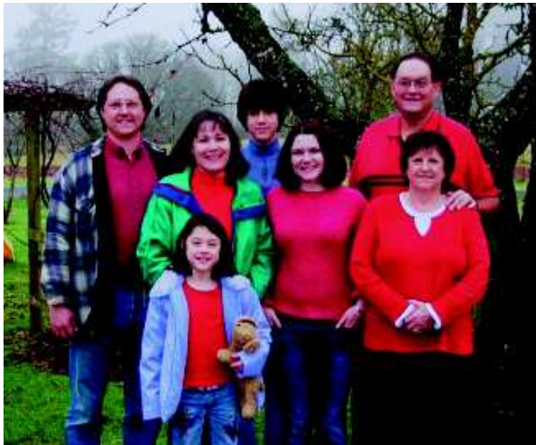
The Crew - December 2004

The stalks grow to about 5½ feet with ears setting about one foot from the ground. Retains the good flavor of 'Golden Bantam' but reaches roasting ear stage 3 to 10 days earlier. The ears are 6 to 8 inches long averaging 12 rows of golden yellow kernels. We offered a limited release of this variety last year and although still in short supply, have a better stock for the 2005 season. Refer to page 15 for ordering information.