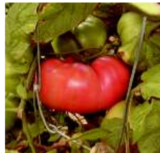
'Marianna's Peace' Tomato