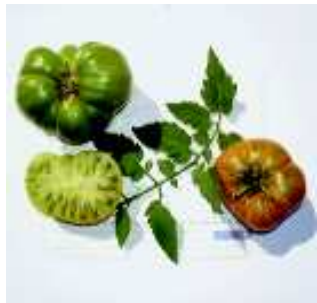
'Aunt Ruby's German Green' Tomato

We only offer untreated open-pollinated and heirloom seeds. No chemicals, unstable hybrids or GMOs!