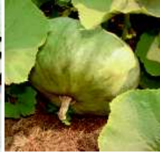
'Sweet Meat' Squash