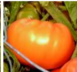
'Kellogg's Breakfast' Tomato

On the cover: The "cabin" on our farm, with fields and trial gardens in the background, through the four seasons of 2004. This is the same view you can see from the webcam on our site.